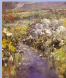
Spring in the Bog, Inver, Co. Donegal

The excellent combination of art and woodturning ensures that this exhibition is one of the most popular and highly anticipated events in the programme. Featuring the work of local artists and the Ulster Woodturners, there is a great mix of traditional and more contemporary styles and themes, so don't miss the chance to shop for that extra special Christmas present.